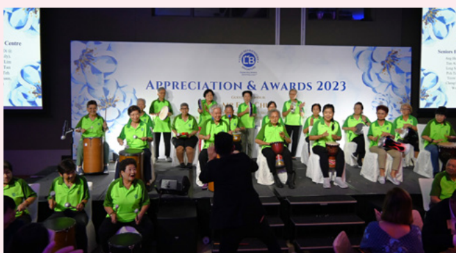
Seniors from LB AACs @ Mei Ling 150, Tampines 494E, Tampines 434 and Ang Mo Kio 318 highlighted A&A with their performances.