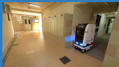
AIDEN can avoid obstacles and give way to oncoming human traffic.