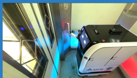
AIDEN possesses an extendable arm that is able to detect and press the correct lift buttons.

Unlike conventional commercial AMRs, AIDEN boasts the unique capability of moving vertically within a building by taking lifts without requiring any expensive overhaul to existing lift infrastructure. These cost savings will allow AIDEN to be swiftly and efficiently deployed in various settings and applications, pending its successful trial.