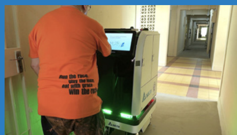
The contents in AIDEN's locked compartments can be retrieved by allowing the robot to scan a QR code given to the senior.