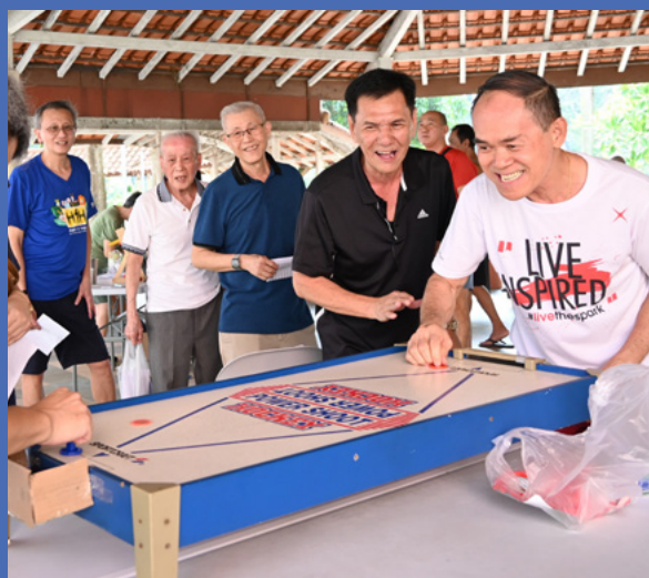
A male-only senior carnival, Octo-"beer" Fest enjoyed a turnout of over 30 LB male seniors who bonded over games like air hockey, darts and football.

To encourage more male seniors to participate in our active ageing programmes, events catered to the gentlemen are planned! One of these was the Octo-"beer" Fest at LB AAC @ Mei Ling 150 on 6 October 2023, a guys-only event filled with fun male-centric game stations and non-alcoholic beverages.